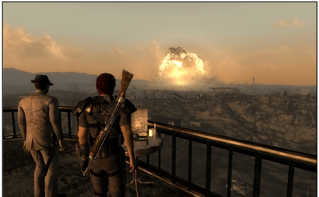
Fallout 3: Destroying Megaton

in a virtual setting. The game developers were creating an environment where a child (or adult) could possibly recreate some of the most horrific moments in human history. The moral ramifications are obvious as young children are not capable of fully understanding the consequences of these actions. These types of experiences lead to a desensitization of a person's perception of death and murder. They will begin to associate real death with virtual death and thus become disconnected from a very real part of life.