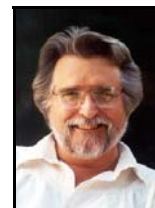
Neale Donald Walsch

Oprah Winfrey’s misplaced faith in Marianne Williamson and the New Age teachings of A Course in Miracles is a sure sign of the times. But an even surer sign of the times is that most Christians are not taking heed to what is happening in the world and in the church. We are not contending for the faith as the Bible admonishes us to do (Jude 3). It is time for all of our Purpose-Driven and Emerging church pastors to address the real issue of the day. Our true Lord and Saviour Jesus Christ is being reinvented, redefined, and blasphemed right in front of our